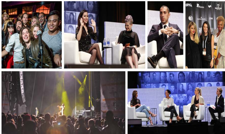
( http://www.forbesconferences.com/wp-content/uploads/sites/2/2016/03/Under30_3016_Boston_PhotoCollage1.jpg )