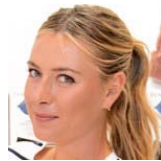
Maria Sharapova Sugarpova