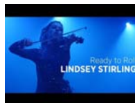
Lindsey Stirling: It's All About Connection 3:10