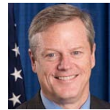
Governor Charlie Baker State of Massachusetts