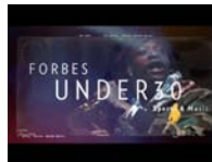
Under 30: Music and Sports Edition 1:19