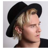
Bart Baker YouTube