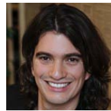
Adam Neumann WeWork