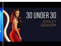
Ashley Graham: A Cover Girl With Curves 1:21